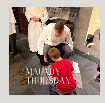
Thursday, March 28 7:30 pm The Maundy Thursday liturgy, marked by footwashing and the institution of the Eucharist. Remain and keep watch with the Maundy Thursday Vigil