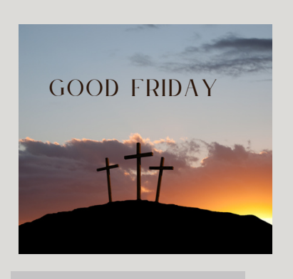
7:30 pm This solemn service includes Holy Communion with the reserved Sacrament and the Passion sung by the St. Paul's Adult Choir.