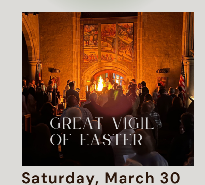
7:30pm Celebrate the principal liturgy of the church year. Beginning in candlelight with a reflection on the salvation story, celebrating baptism, and culminating in the joyous first Eucharist of Easter Day. Festive reception to follow