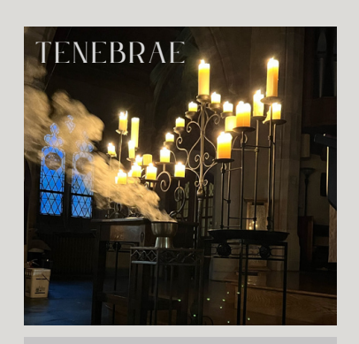
Wednesday, March 27 7:30 pm Gather in the church for the service of Tenebrae, ancient, reflective services to prepare for the great three days of the Triduum