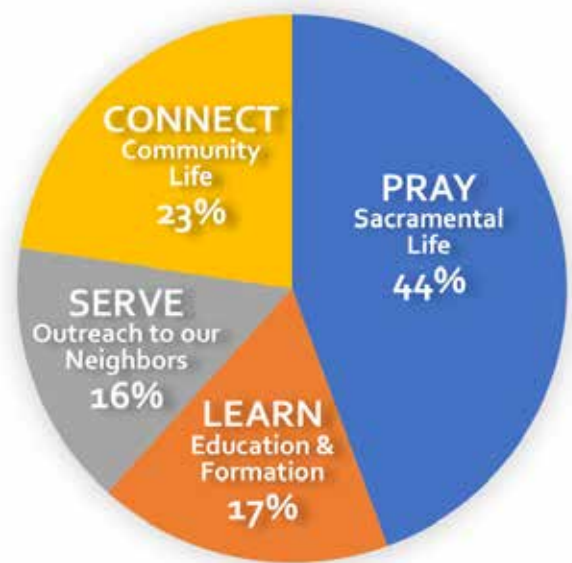
Expenses Spread by Ministry Area

Every dollar pledged funds our mission. This proportional breakout ( right ) shows how funds are allocated across mission areas.