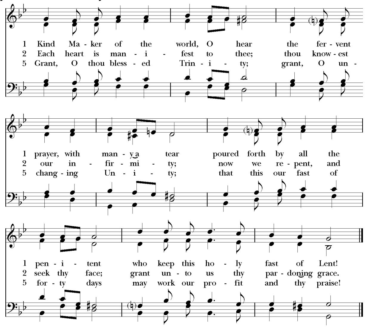
words: St. Gregory the Great (540–604); ver. Hymnal 1940 , alt. music: A la venue de Noël, melody from Fleurs des noëls , 1535 words © 1942 Church Publishing, Inc.. All rights reserved. OneLicense.net License #A-709109