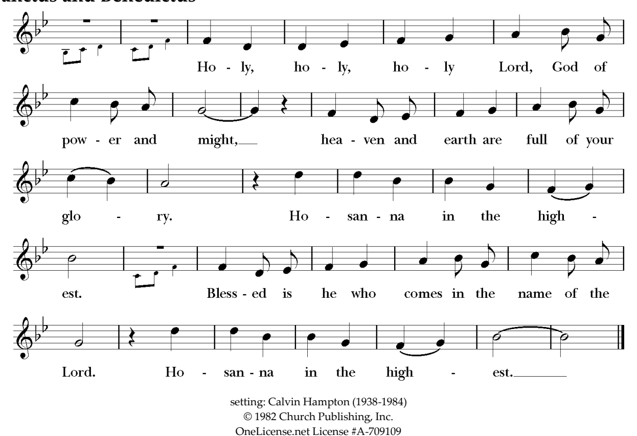
The Celebrant continues

Blessed are you, for the birth of creation. Blessed are you, in the darkness and in the light. Blessed are you, for the prophets' hopes and dreams. Blessed are you, for signs and wonders we see of your work in the world. Blessed are you for your Son Jesus, the Word made flesh.