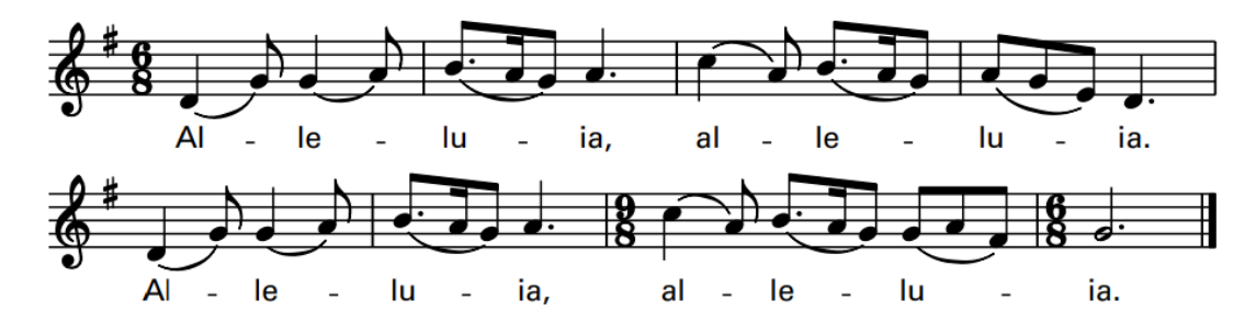
music © 1985, 1996, Fintan O'Carroll and Christopher Walker. music published by OCP. All rights reserved. OneLicense.net License #A-709109